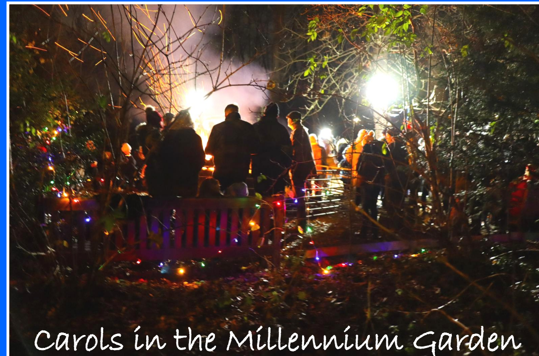
Carols in the Millennium Garden

The views expressed by contributors are not necessarily those of the Parish Council.